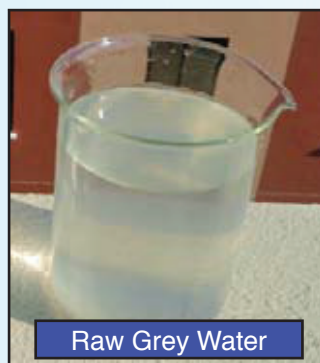
Raw Grey Water