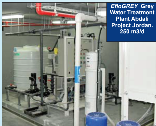
EfloGREY Grey Water Treatment Plant Abdali Project Jordan. 250 m 3 /d